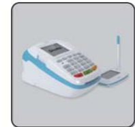
EFT POS Terminal