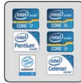
Compatible with Various CPUs