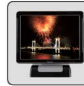
Industrial LED Display