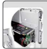
Solid AI Frame Construction (TITAN-500)