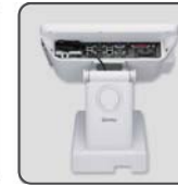
Upper I/O Panel for Easier Control