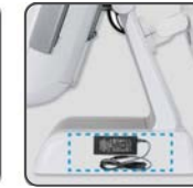
Built-in Power Adaptor