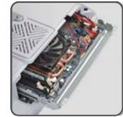
Easy Access to Motherboard (TITAN-500)