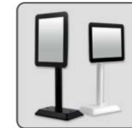
9.7" Pole Display